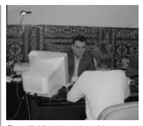
The public information and complaints reception office, in Paseo de Eduardo Dato, 31.

As far as the site is concerned, it has been improved in order to help citizens. In this regard, we can say that, during the course of 2004, the site www.defensor-delpueblo.es has been accessed a total of 10,994,376 times. The number of calls or visits received in the visitor room was 2,263. By telephone, 7,250 requests for information were dealt with and the freephone line 900 10 10 25 received 3.231 calls.