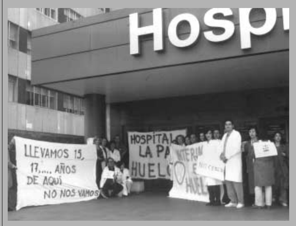
Temporary doctors protesting against their professional and salary situation.

Actions started regarding labour conditions and the social welfare of the collective group formed by the so-called backup personnel for providing continuous attention continue. From the information supplied by the Asturian Health Administration, it was deduced that the problem generally affecting the backup personnel in this Autonomous Community is being channelled through the progressive equalisation of their working conditions, with regard to working times and the remuneration system, with professionals in primary health care, which has been undertaken in other autonomous communities such as Castile and León.