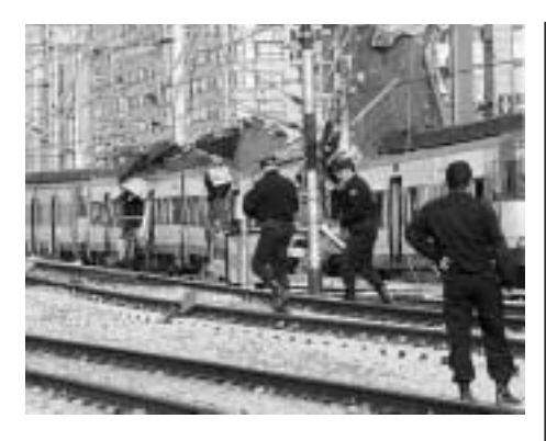
One of the trains in the attacks of 11th March 2004, is looked over by members of the Police, after removing it from Atocha station.

security measures existing on the railway line that joins the capital Madrid with villages in the north-east of the community, managing to obtain a report from the Government Delegation in Madrid and the Chairman of Renfe.