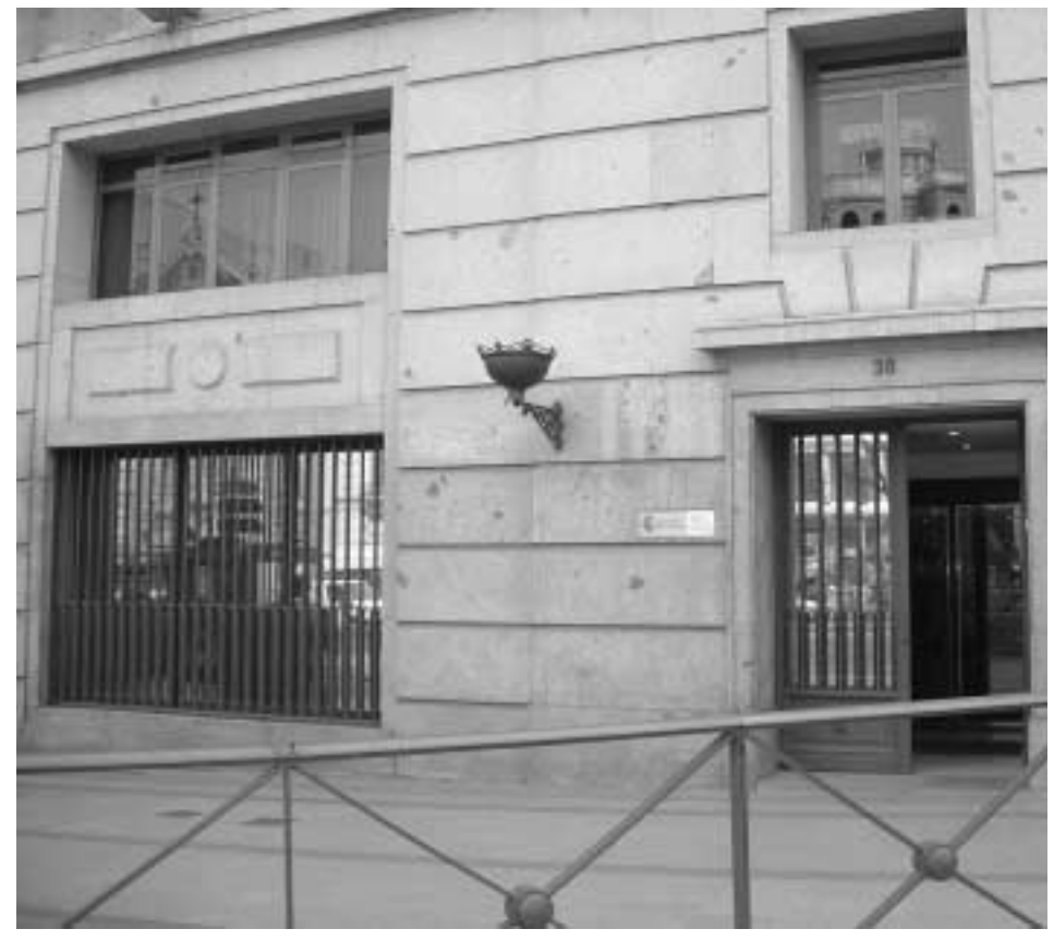
Directorate General for Prison Institutions in the Calle de Alcalá in Madrid

In 2004, the Institution visited fifteen prisons: Cáceres, Córdoba, Burgos, Dueñas