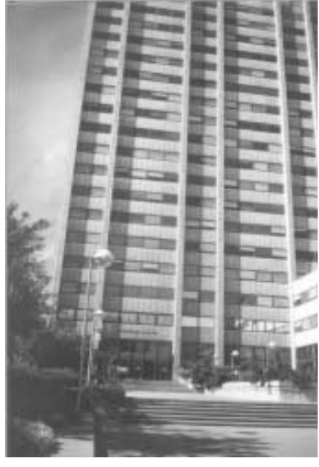
The ombudsman recommended to the Secretary of State for the Treasury that the amount of the personal minimums and family minimums for descendants should be increased.

In some cases a delay of up to three hours could be seen in the payment of fair compensation. This is the case of a lady who stated that in 2001 Marbella Town Hall agreed a price for the property expropriated of 26,116,500 pesetas, the legal interest on the delay being approved on 5th February 2002 for a sum of 16,328.40 euros, without these amounts being paid. After various requests, the aforementioned Town Hall replied that two payments had been drawn pending completion in favour of the interested party for the amounts indicated, these actions having been contested before the Contentious Administrative Chamber of the High Court of Justice of Andalusia. It was stated that this delay in payment was due to a lack of liquidity of the Treasurer's office. The Town Hall wanted to pay the debt with a good property of an equivalent value to that expropriated, plus the interest, which had been accepted. The affected party stated that she did not agree with the property offered, stating that a lack of liquidity of the Municipal Treasurer's office was not preventing this from making other payments with a date later than hers. By reason of the new allegations made, the investigation is being re-opened.