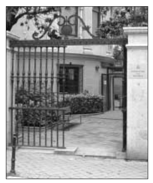
Access to the information office of the Ombudsman, in Paseo de Eduardo Dato, 31