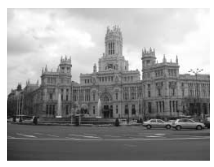
The transformation of the Post Office into a State joint stock company has led to complaints due to transfers of jobs. In the photo, the central post office building in Madrid.