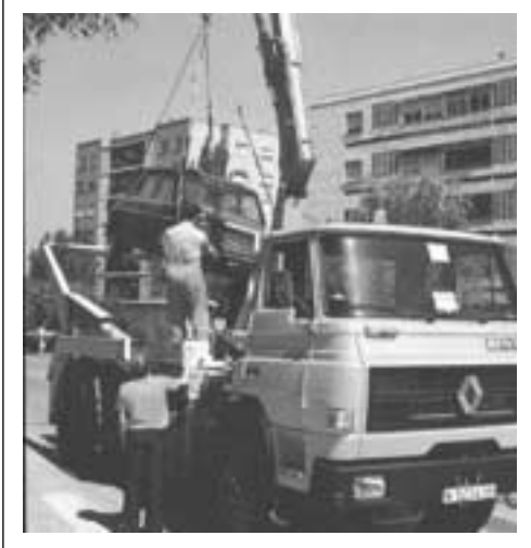
The collection of abandoned vehicles in the street is a major economic burden for town councils.

— The Board of Economy and Finance was asked for a report (expansion of the investigation) on 22/12/2003 on the introduction of the recommendation made at the time with regard to complementing the indemnities provided for in State legislation for those who have suffered deprivation of freedom due to offences included under the Amnesty Act. The third requirement was made on 22/6/2004 and the report was received on 12/7/2004.