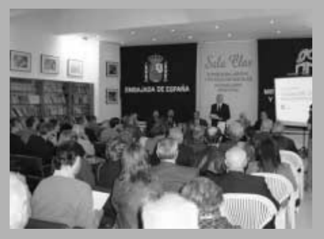
Meeting with Spanish immigrants in Argentina to inform them of the health care they receive from Spain, in the Work and Social Affairs Council of the Embassy of Spain in Argentina.

Finally, it is necessary to state the high number of complaints received from Spaniards adopting girls in China, due to the delays in recording these minors in the registers in the Consular Section of the Spanish Embassy in the Popular Republic of China. The Embassy informed that personnel for attending to this need which is on an upward trend is increasing, causing a reduction in the waiting time to more reasonable limits.