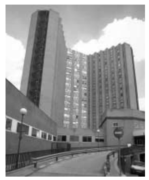
The management and operating of hospitals are the causes for the decreasing satisfaction of users and patients with regard to the sanitary system as a whole. In the photo, the Hospital 12 de Octuber in Madrid, near to which work on the new building to substitute this has commenced.

the load of providing assistance for these sick people falls.