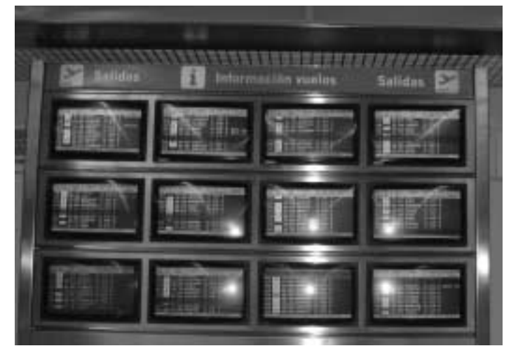
Flight information panel in Barajas airport.

However, this same norm defines the telephone service available to the public as "commercial operating for the public of the direct transport and switching of the voice in real time with the origin and destination in a public switched telecommunications network between users of both fixed and mobile terminals" which, in practice, implies excluding this Secretary of State from competence for resolving claims on the Internet service.