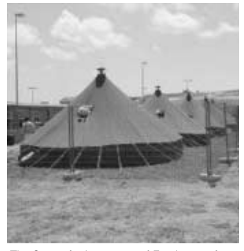
The Centre for Internment of Foreigners of Fuente de la Purísima in Melilla has had to be enlarged with tents, as can be seen in the photo of Diario Sur.

Special attention should be paid to the situation of persons, generally with a Sub-Saharan origin, who after reaching Spanish territory through a non-entitled position