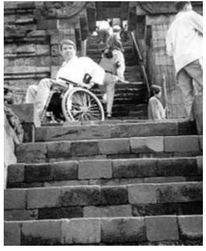
Architectural barriers is a subject which many town councils have yet to tackle when it comes to town planning regulations.