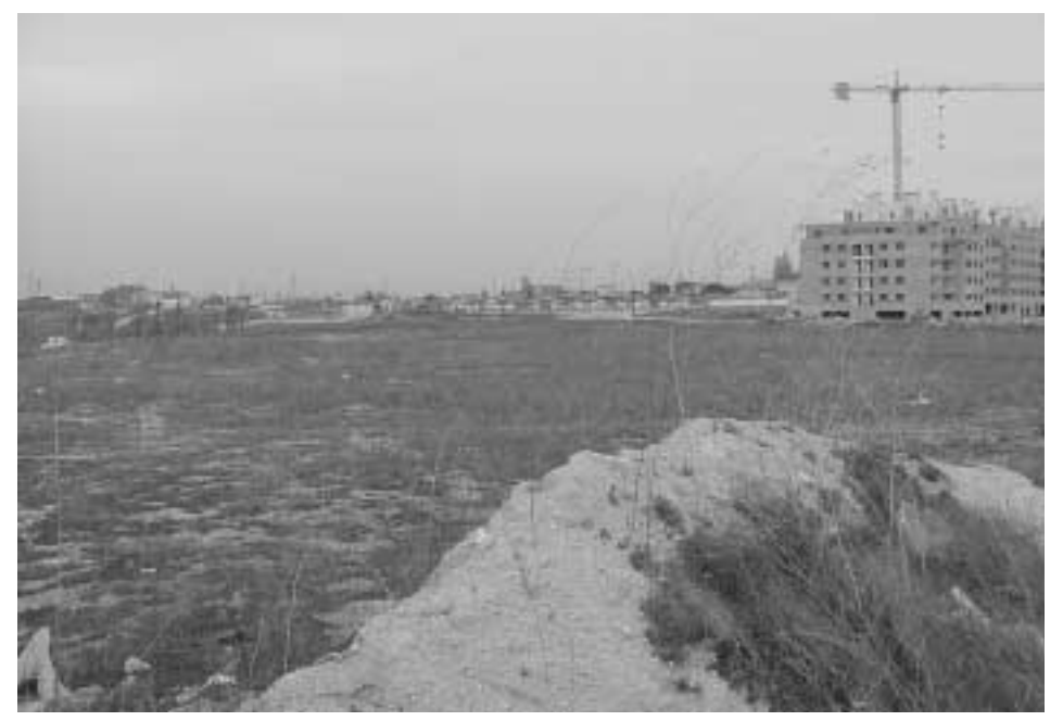
Montecarmelo Estate for Planning and Development in Madrid, where there are still many dwellings to be built, in spite of the fact that others have already been handed over, with people living there without even the elementary services, just as in other Programmes for Urban Action.

The public is unable to comprehend that a Town Hall can award the management of land development, without their consent, to a developer who, without being the owner of the land, can present a programme of the development work to be carried out. They also report that the promoter, as a general rule, gives insufficient value on the price of the land and the existing buildings so that, if the owner opts for payment in land, as this has little value, he is obliged to cede a good proportion of this or, if he does not have sufficient land or money to pay the development quotas, even recur to expropriation, normally with a corresponding indemnity that is far behind market values. Because of this, it is necessary for the public administrations to maximise control over the valuations made by the developers with the object of these showing the real value that the market gives to this type of land and the buildings existing on it with the greatest exactitude possible.