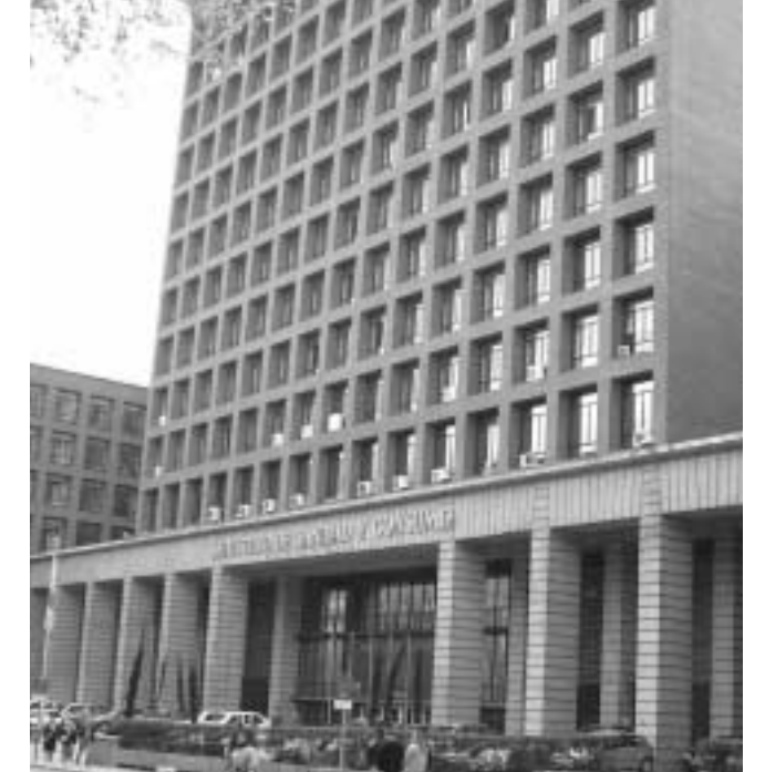
Inequalities in health assistance provided by the different health services persist, most of all in external consultancies and diagnosis tests. In the photo, the Ministry of Health and Consumption, responsible for the coordination of the health services in the autonomous communities.

Mental health continues to be one of the great challenges pending in the Spanish health system. This is indicated by the high volume of complaints that are still received by the Ombudsman regarding mental health, that have an influence on the fact of there not being any rehabilitation structures with defined action programmes or these being insufficient; on the need to encourage effective coordination of the different networks and services, and on the situation of families of the mentally sick, on which a large part of