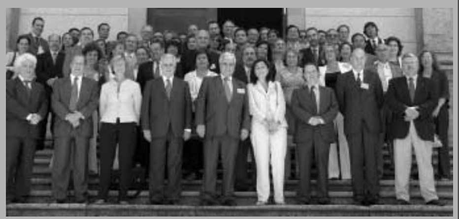
Photo of the Ombudsmen and Autonomous Commissioners attending the 19th Conference on Coordination held in Santiago de Compostela from 28th to 30th June 2004.

Equally, the lack of places in public residences is recorded. In this sense, at the meeting in Santiago de Compostela, the Autonomous Commissioners demanded an effort from the State and autonomous communities to invest and increase the number of residential places as quickly as possible, above all those of a public nature, and for assisted ones, in order to comply with the National Gerontological Plan and to correct the waiting lists.