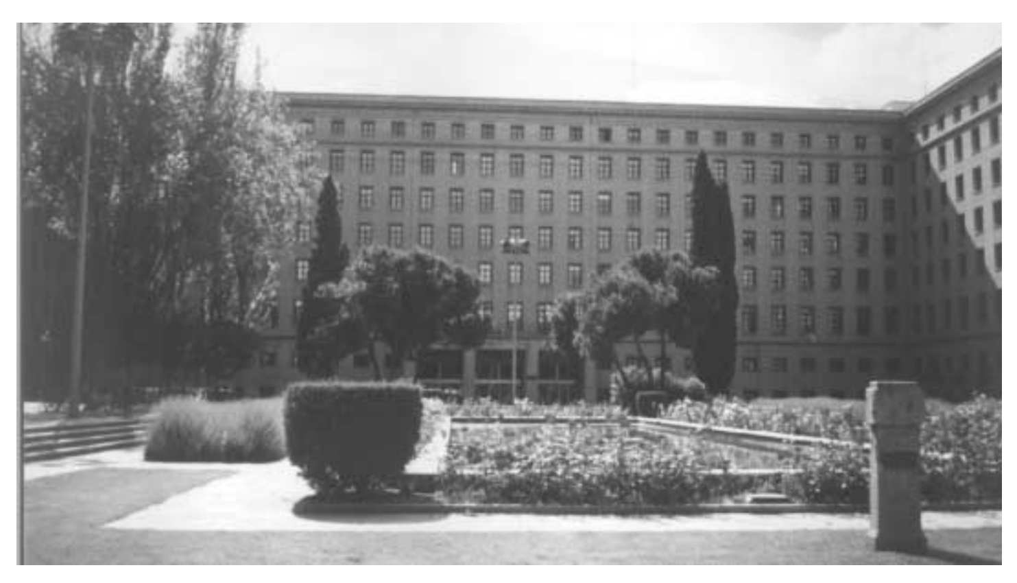
Ministry of Public Works, whose Secretariat of State for Infrastructures has been required to produce reports, previously requested, on delays in payments for expropriations.