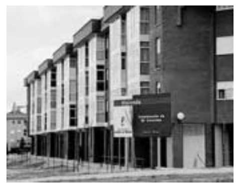
Complaints about the rise in prices of housing, lack of flats to rent, empty houses and defects in constructions increase every year. The photo shows VPO housing.

The increase in citizen complaints against deficient building in protected housing has to be reported, having