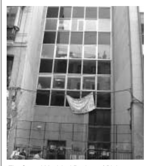
The Central Municipal Registry of Births, Marriages and Deaths in Madrid in the Calle de la Montera

Another section referred to complaints relating to the Municipal Registry of Births, Marriages and Deaths. The important number of this type of complaint shows how this part of the Administration has not known how to adapt to the new reality of Spanish society, which has passed from being a country of emigrants to being a country that receives immigrants. This fact has direct repercussions on the Municipal Registry of Births, Marriages and Deaths, particularly with regard to nationalities and the recognition of marriages of Spanish citizens with citizens of other countries. It can be stated that, at this moment, the Municipal Registry of Births, Marriages and Deaths is a part of the Administration that urgently needs immediate reform in order to be able to offer citizens the services they require.