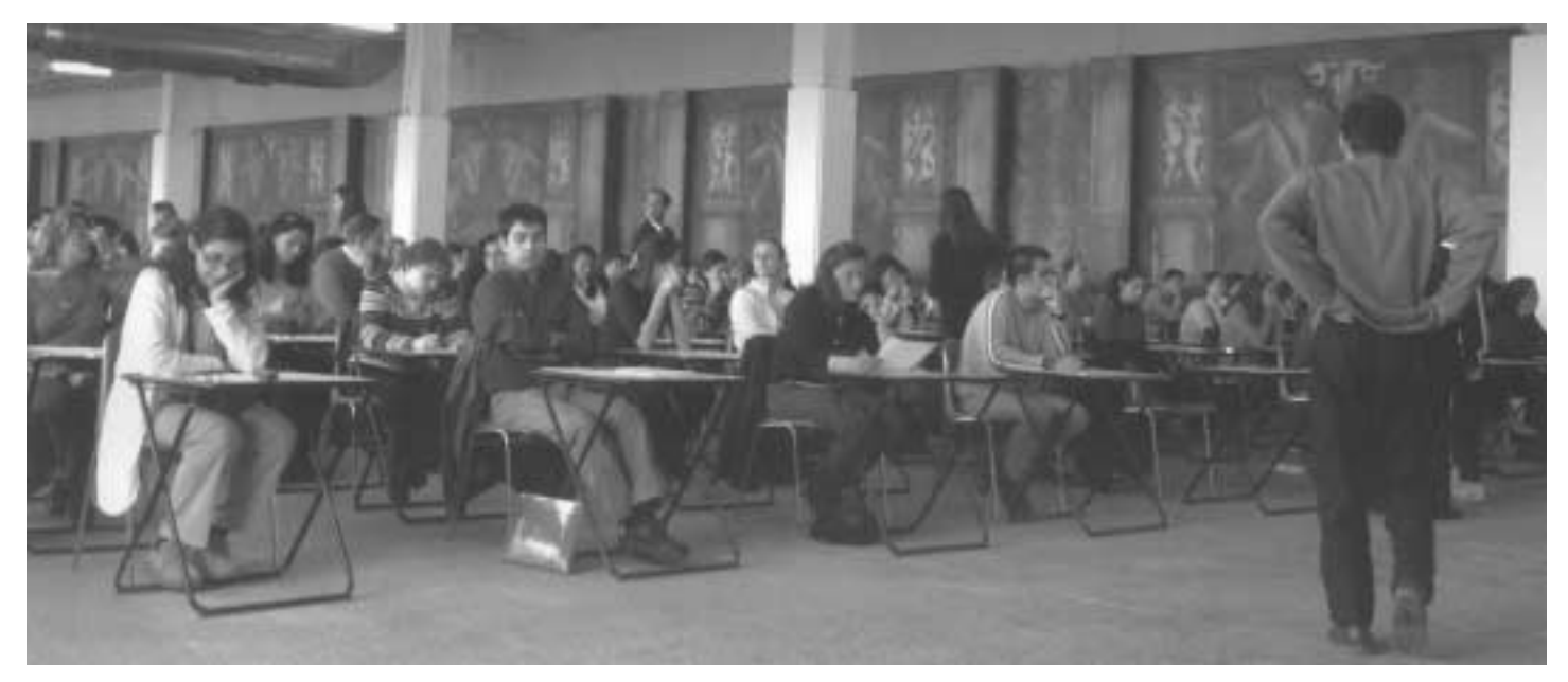
Civil Service candidates do not want to have opinion polls presented to them at the time of the examination. The photo shows candidates for administrative support services in Madrid Town Hall.

A report was requested on the posture maintained by the aforementioned Ministry with respect to these questions and how they are dealt with in a document, signed by more than 1,700 university lecturers, with reference to the re-definition of scientific fields, the methodology followed for evaluating work and scientific validity criteria.