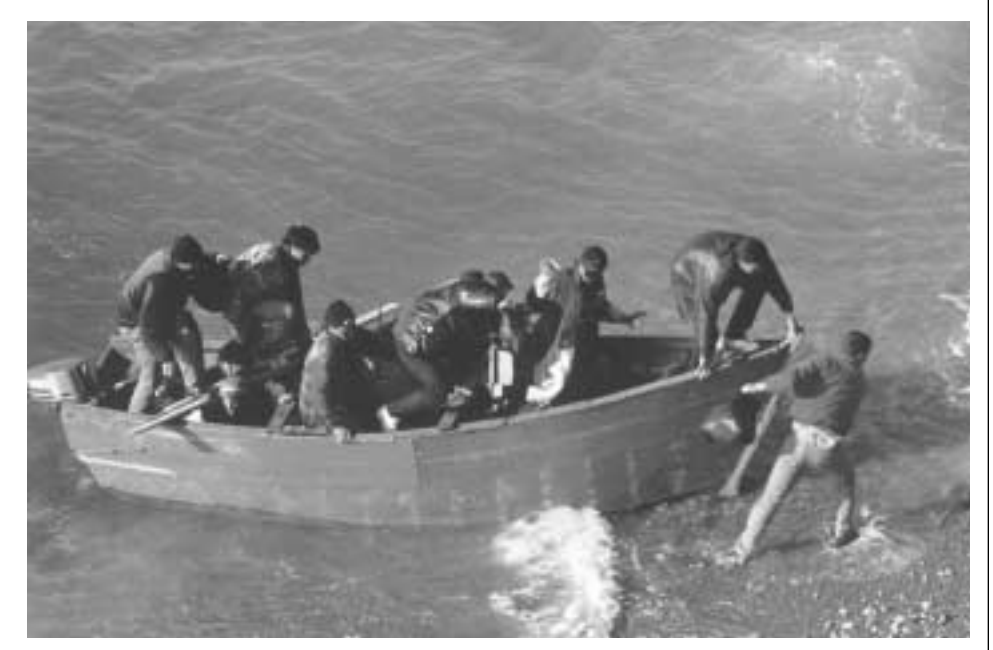
In spite of successive standardisation or regularisation processes for illegal immigrants and of the collaboration of Spanish and Moroccan police to prevent this, the arrival of boats on Spanish coasts does not stop. The photo of EFE captures the moment at which a boat arrives at a beach in Almeria

In cases arriving at this Institution, the Ombudsman stated his non-conformity with the resolutions adopted, without the criterion of this Institution being accepted.