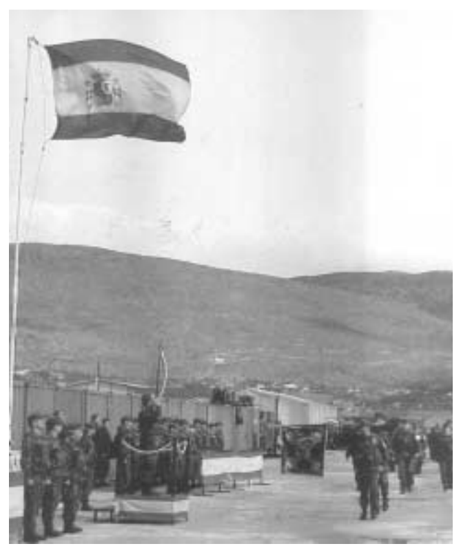
The new Professional Army is giving problems, among standby, troop and navy military personnel, through ceasing their service relationships. The photo shows a review of a military detachment posted to Bosnia-Herzegovina at the time.

Standby, troop and naval military personnel who have ceased their professional services relationships in accordance with that established in Law 17/1999, of 18^{th} May, of