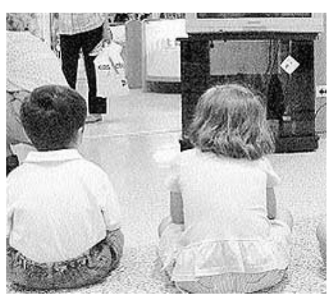
The programming of television channels for children and youngsters, full of so-called "telerubbish", gave rise to a social debate, and later to an agreement between the Government and the national and autonomic channels, in order to adapt this programming.

also underway at present and have been demanded by this Institution for so long, will also become reality.