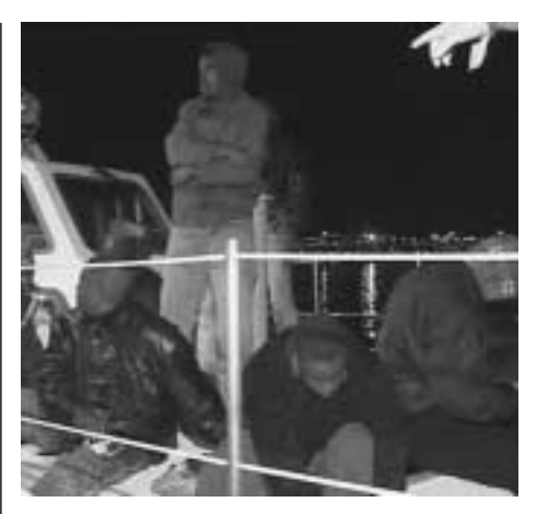
Sub-Saharan immigrants saved from the wrecking of a boat

— By the Ministries of Public Works and the Economy and the Interior, on the wrecking of a boat on the coast of Rota (Cádiz), to provide greater rescue measures to the competent services and improve coordination and response time when there is a shipwreck emergency.