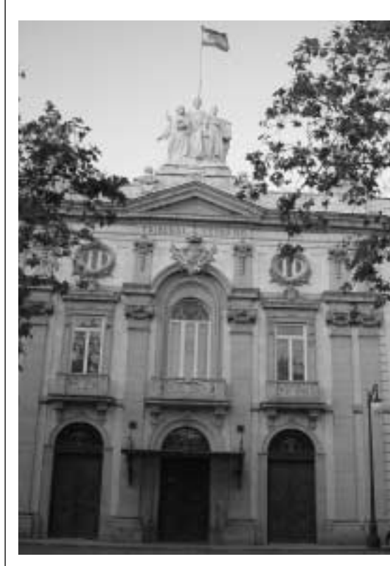
The Chambers for Civil Matters and Contentious Administrative Proceedings of the High Court have considerable delays. The photo shows the main entrance to the High Court.

With respect to the official investigations, the most relevant one was that regarding a woman assassinated in Barcelona after having made 54 charges against her husband in the past ten years. This complaint ended with two recommendations to the Catalan Health Institute and the Directorate General of Police. Furthermore, the conclusions obtained were sent to the General State Public Prosecution Service.