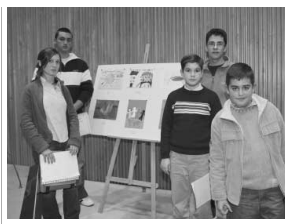
The Schoolchildren awarded prizes, with their pictures.