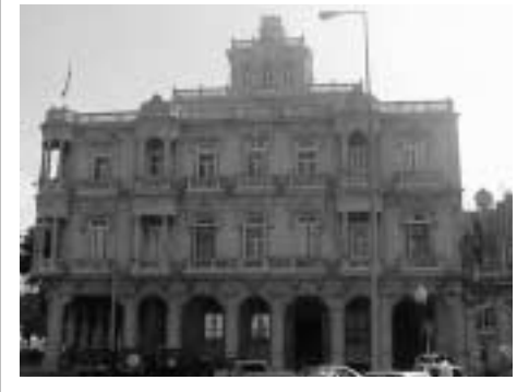
In the majority of consulates where visas are issued for Immigrants who wish to travel to our country there are delays, like in the one in the photo, corresponding to the Consulate of Spain in Havana.

With regard to assistance from consulates, of a general nature, deficiencies have been observed in information on web sites of an important number of consulates regarding the requirements necessary for obtaining a residence permit, in telephone attention services, together with delays in the handling of files in consulates of countries with a higher index of immigrants. Delays in the legalisation service in the Spanish Consulate in Quito (Ecuador), a delay of several months in appointments for making applications for visas for staying in the country in the Spanish Consulate in Bogota (Colombia), deficient telephone attention in the handling of visas in the Consulate in Kiev (Ukraine) and a similar situation in the