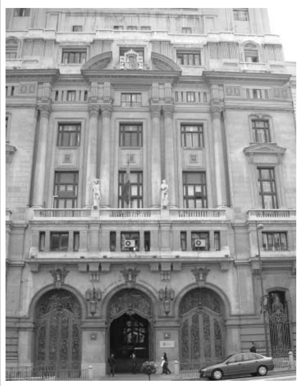
The instability of the educational system and its lack of resources give rise to the deficient results at different levels of education, in comparison with neighbouring countries.

Times of change are also being felt in the area of university education. At present, modifications in the system for access to