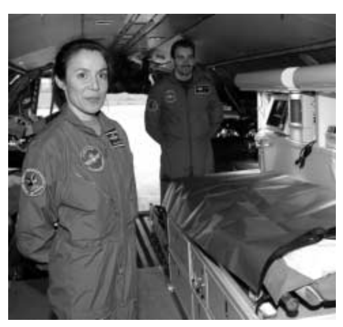
Female members of the Guardia Civil want the same treatment as other civil servants in cases of leave to attend to sons/daughters or maternity permits. The photo shows the interior of an air ambulance of the Guardia Civil.

Slow implementation of the provisions included in Law 31/1995, of 8<sup>th</sup> November, on the Prevention of Labour Risks can be seen.