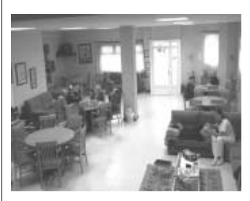
Day centre for the elderly suffering from Alzheimer's disease

The Treasury also stated its non-conformity with the low amount of the reductions in the family minimum for descendants, by understanding that it is not adapted to the real measurement of expenditure and, on the other hand, accepts a higher deduction in the case of making contributions to a pension scheme. Furthermore, it considers the present system of family tax payment to