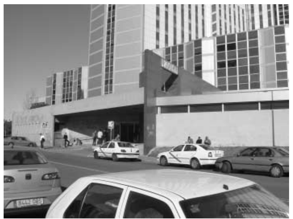
The management of large hospitals is the source of a good number of complaints. In the photo, the emergency wing of the Ramón y Cajal Hospital, in Madrid.

The contents and programming of public communications media have been the subject of complaint following a call for attention made by the Ombudsman himself when presenting the 2003 Report to the Chambers. For that reason, there are plans to carry out a rigorous monitoring of the situation so that the existing control systems can be made to work, above all with regard to the contents of television programmes (see page 50).