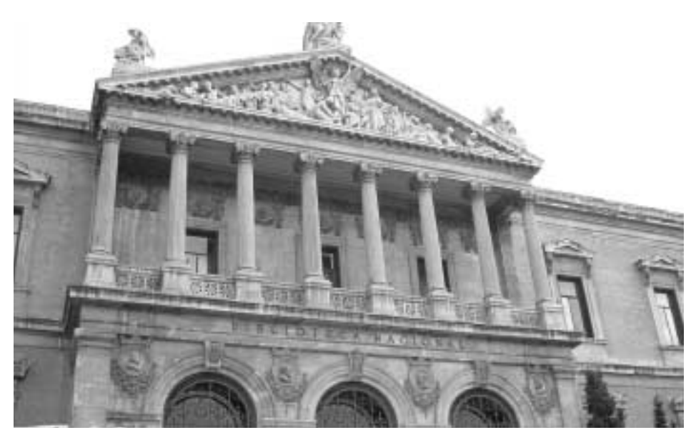
The National Library. 200,562 citizens using libraries through out the whole of Spain are opposed to the establishment of a royalty for taking out books.

for Universities and Research, by which the procedure and period was determined for the presentation of applications for assessment of research activity to the National Evaluating Commission for Research Activity.