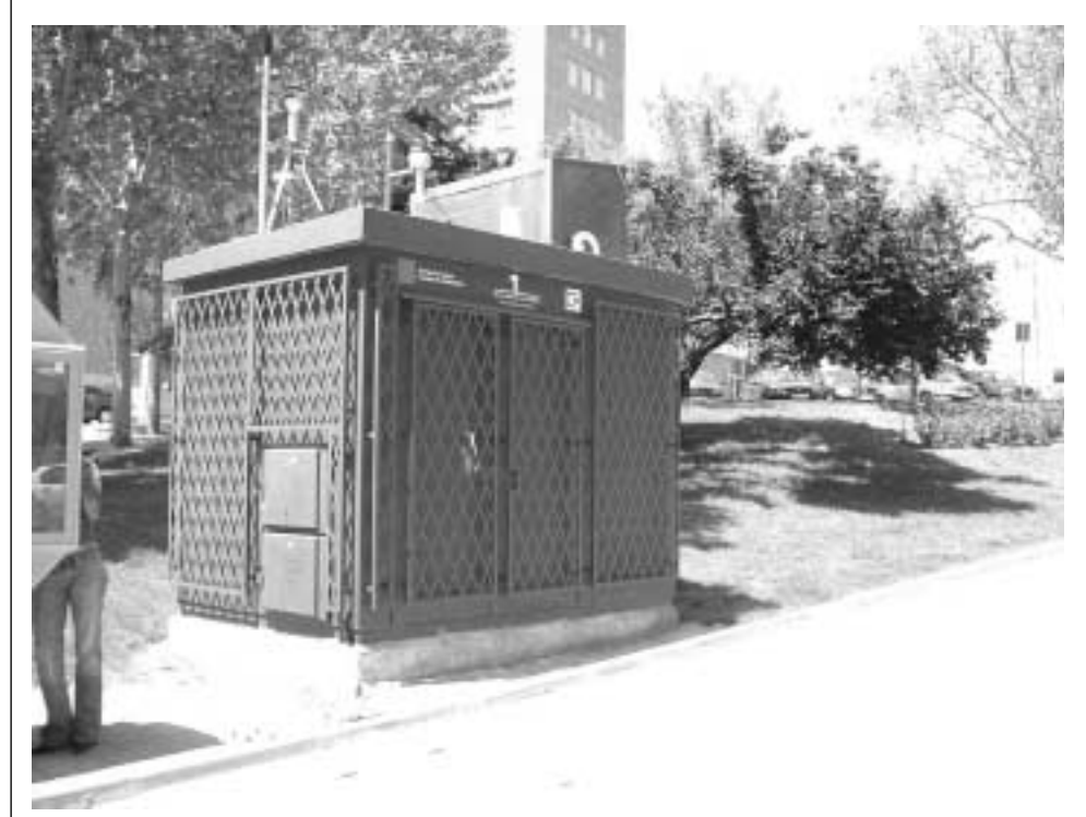
Station for measuring environmental, acoustic and pollen contamination in a street in Madrid.

With regard to the high voltage lines whose problems required preferential attention in reports in recent years, advances