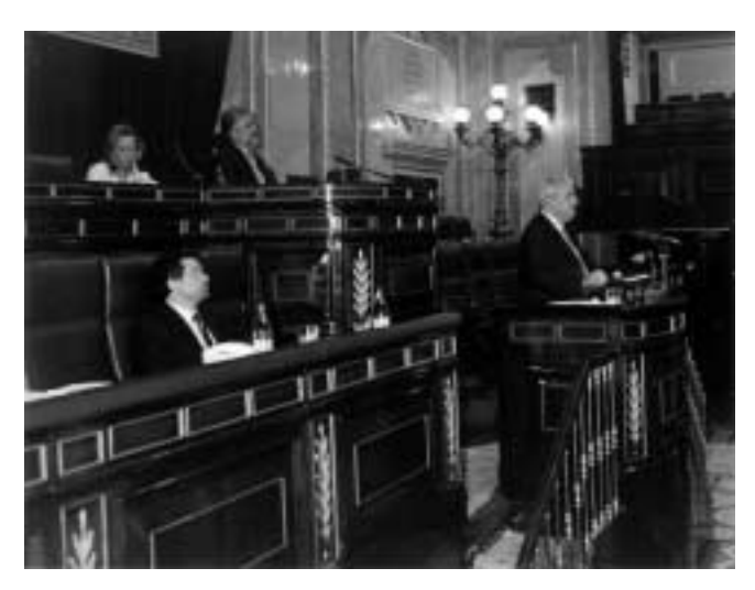
The Ombudsman Enrique Múgica, in the plenary session of Congress, presenting the Report for 2003.

in Zaragoza, sometimes associated with the deterioration in the health of inmates as a result of drug taking; watching over the sanitary conditions in order to make check-ups and medical reports more widespread in transit centres and in transfers of prisoners, plus the use of new technologies and the need to hasten the construction and opening of new