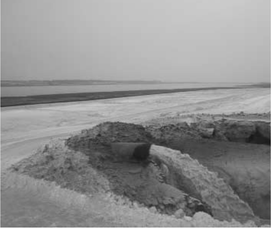
Pollution from uncontrolled dumping in the Huelva Estuary.

The growing concern over housing has its origins in house prices, which in turn produces evident distortions in the market. Although certain measures have been taken in this regard, a check will have to be made of their functioning in reality notwithstanding certain reservations which can already be formulated: excessive restrictions on subsidies for tenants under the age of 35, resumption of collecting the subsidy once the conditions that are demanded have been met, the low amount of the subsidy. Complaints received also refer to shortcomings in the construction of protected housing and construction defects, and their difficulties in repair in the case of free market housing.