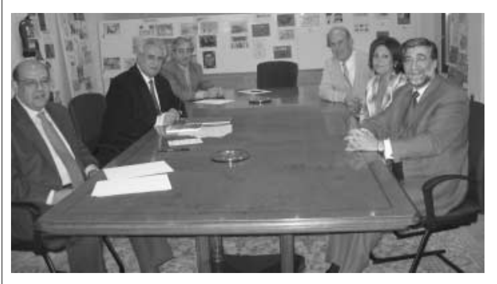
Meeting of the Ombudsman and the Second Deputy Ombudsman with representatives of the Spanish Federation of Heart Transplant Patients who informed him on organ transplant in Spain.

— Attendance at the 10<sup>th</sup> Conference on Pharmaceutical Specialities.