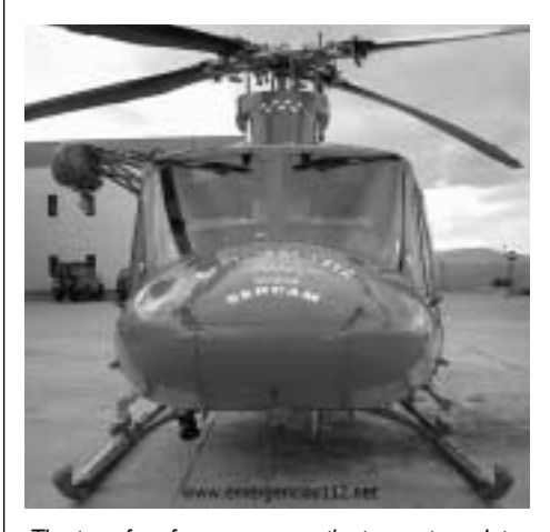
The transfer of emergency patients creates a lot of complaints in different services, especially in ambulance transport in major cities, due to traffic jams, or in helicopters between islands. In the photo, the "emergencias112.net" helicopter of the SERCAM of the Madrid Community

— The Board of Education was asked for a report on 3/3/2004 on the climate of violence suffered in a school and which is affecting the safety of pupils and teachers, having very negative repercussions on the development of educational activities, without the corrective actions nor the personnel or material measures which the school has available to it having any effect in preventing the situation that has arisen. The third requirement was made on 20/9/2004 and the report was received on 18/10/2004.