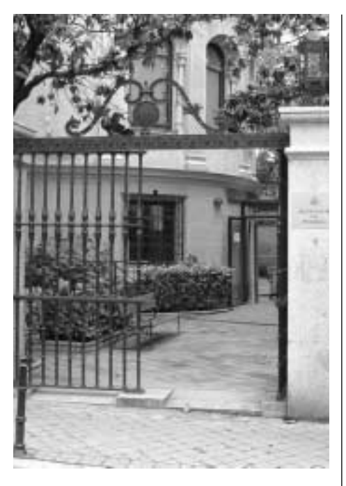
Access to the complaints presentation and information office of the Ombudsman, in Paseo de Eduardo Dato, 31.